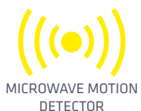
MICROWAVE MOTION DETECTOR